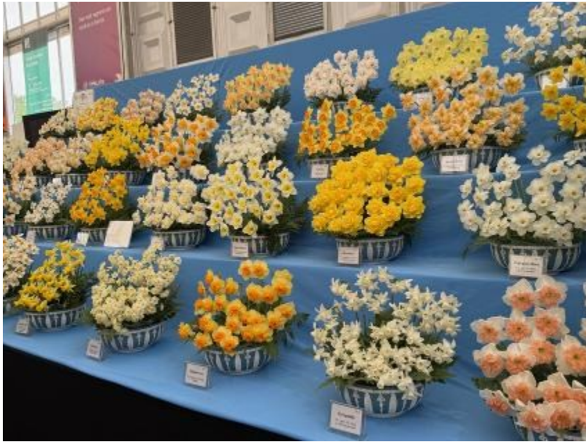
Daffodil Display in main pavilion