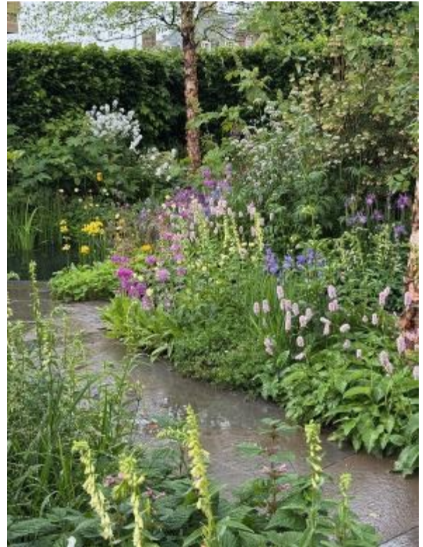
Sample Show Gardens - there were 15 show gardens this year.

the show. It takes 25 days to build the show and 11 days to break it down. The designer I spoke with said that it took about 15 months to plan and execute his garden. The hardest part is to have all plants flowering at the same time regardless of their normal blooming season! I cannot fathom the work that goes into this annual event. Each garden provided a leaflet about the garden, information about the partner charity that was the inspiration for their design, and a QR code to scan and see the garden's plant list.