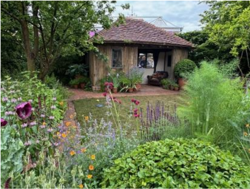
Monty Don's Dog Garden - another show garden; it has been relocated to the Battersea Dogs & Cats Home in London