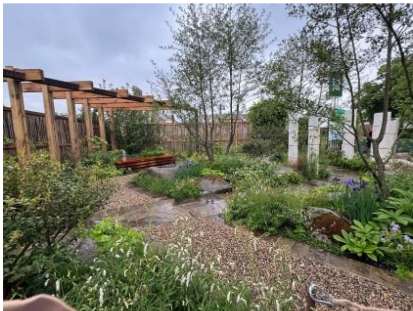
Sample Show Gardens - there were 15 show gardens this year.