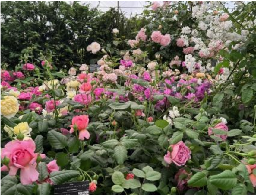
David Austin Rose Display in main pavilion

I will always remember this special experience.