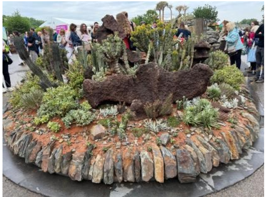
Succulent Garden from South Africa

the show. It takes 25 days to build the show and 11 days to break it down. The designer I spoke with said that it took about 15 months to plan and execute his garden. The hardest part is to have all plants flowering at the same time regardless of their normal blooming season! I cannot fathom the work that goes into this annual event. Each garden provided a leaflet about the garden, information about the partner charity that was the inspiration for their design, and a QR code to scan and see the garden's plant list.