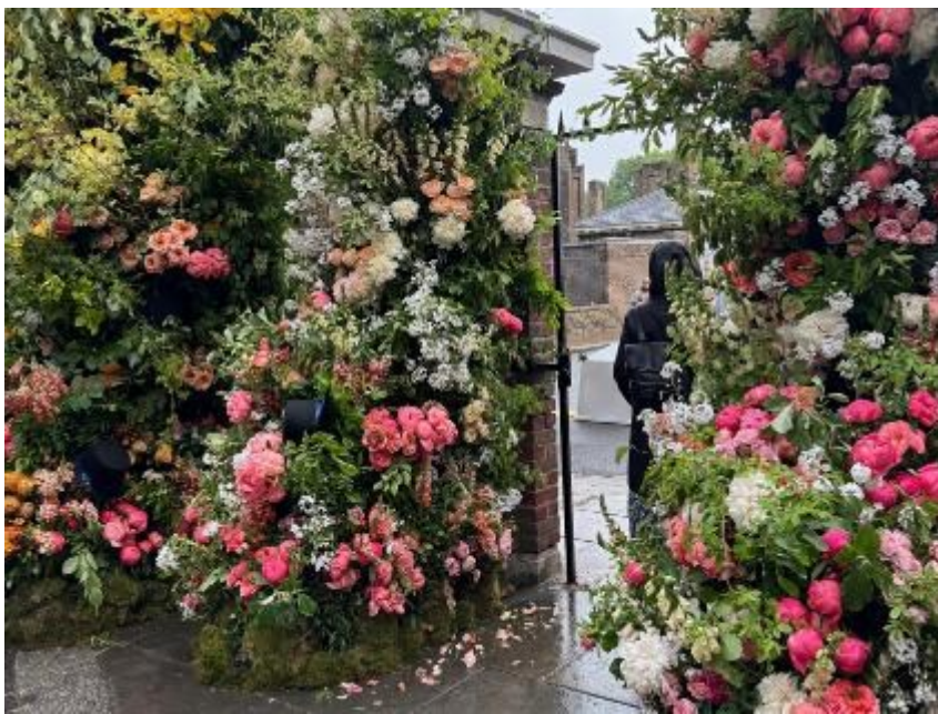
RCFS Entrance - the main entrance to the flower show

Most of the garden designers were onsite and shared info about their garden and how they prepared for