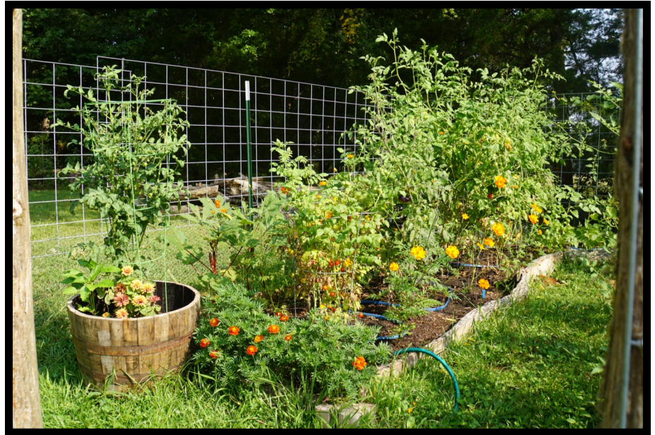
Holly Gardner's collection of various tomatoes (including a couple from the UT Home Garden Variety Trials), cosmos, okra, peppers, zinnia, and marigolds, with cantaloupe on the back fence (That purple pepper plant, in the photo at left, is in the left of this photo in the whiskey barrel).