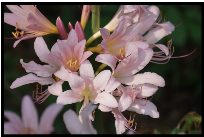
Pink surprise lilies, naked ladies, or Lycoris squamigera for those of you who like scientific names.