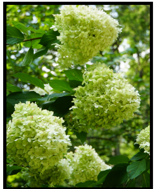
'Limelight' hydrangea, Hydrangea paniculata 'Limelight' (right)